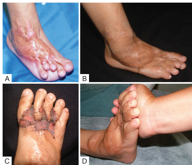
Figure 6 – Group 2 patient. In A , important scar retraction due to the nongrafting in the acute phase of the burn injury. The misalignment of the toes without ground contact and hallux deviation is observed. In B , visible longitudinal gain of the foot with the descent of the toes and improved plantar support. In C , second surgery for refinement. As in case 1, broken incisions and skin grafting restored the interdigital commissures and alignment of the toes. In D , the second surgery restored not only the full contact of the toes with the ground, but their full flexion as well.

The child presented with greater scar retraction than the first case as a result of the nonperformance of grafting in the acute phase of the burn injury; this emphasizes the effect of a greater lack of skin. The toes were misaligned and did not contact the floor. In addition, deviation of the hallux was apparent.