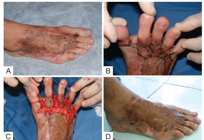
Figure 5 – Group 1 patient. In A , the aspect of burns treated with grafting in the acute phase showing a large longitudinal bridle and evident hypertrophy on the dorsum of the foot. In B , the lack of skin on the metatarsophalangeal region with incision markings aiming for longitude and transverse elongation. In C , a large bloody area is apparent after the completion of the planned incisions, indicating a need for skin coverage. In D , correction of the hypertrophy of the dorsum with the restoration of the interdigital commissures, full support of the toes on the ground, and the ability to flex them by repositioning the skin coverage promoted by the autograft.

The patient complained about pain in the burned region and was treated with grafting in the acute phase. He presented