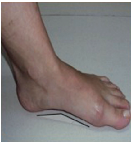
Figure 2 – Internal longitudinal arch.