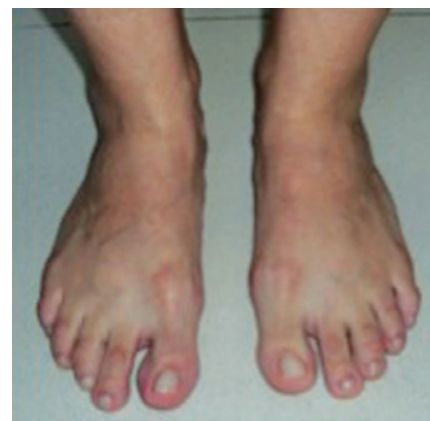
Figure 4 – Toes contacting the ground.