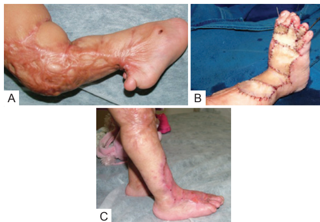
Figure 7 – Group 3 patient. In A , a large bridle extending from the knees to the dorsum of the foot with the involvement of the tibiotarsal joint. In B , the bridle was interrupted by transportation flaps and full-thickness skin grafts taken from the abdomen. Fixation with Kirchner threads in the neutral position of the hallux as well as the calcaneus with the tibia was performed, restoring the 90° angle of the tibiotarsal joint. In C , postoperative period, emphasizing the plantar support obtained.

In this case, there was great concern for the restoration of the 90° angle of the tibiotarsal joint, which was compromised by a large bridle that extended from the knee to the dorsum of the foot. The bridle was interrupted with transposition flaps and total skin grafts taken from the abdomen. Fixation with Kirchner threads of the hallux in a neutral position as well as the calcaneus with the tibia restored the 90° angle of the tibiotarsal joint. The treatment was ultimately successful: the patient was already on plantar support, ambulating, returning to her usual activities, and resuming normal development with no delays.