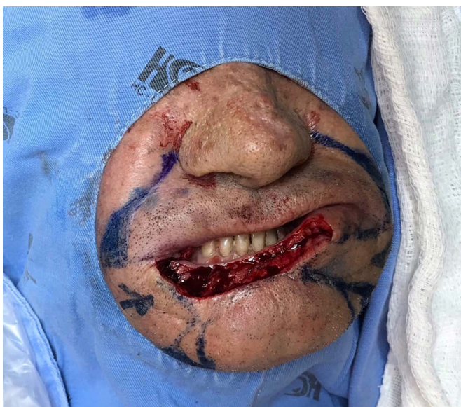
Figure 3. Defect after excision of the lesion with margins.

mucosa to release the modiolus region to facilitate lip closure.