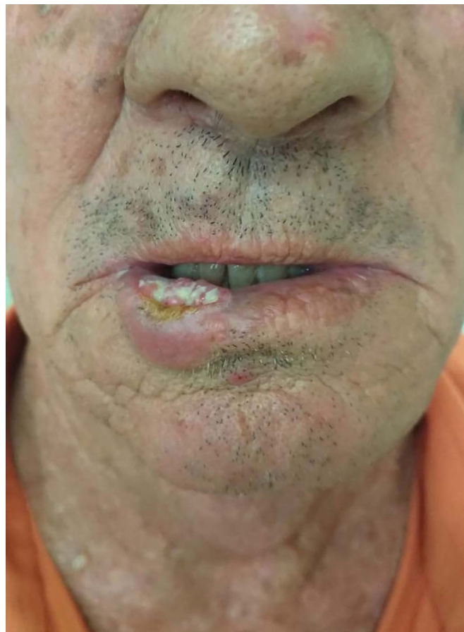
Figure 1. Preoperative.

He underwent excision of the lesion in a hospital environment, under a day hospital regime. For reconstruction, the lesion with radial margins of 1 cm