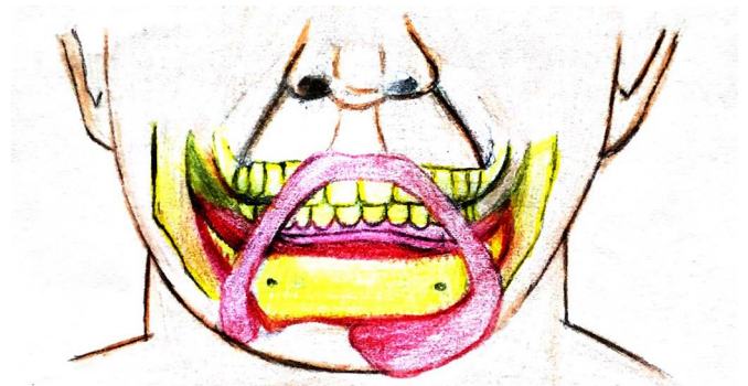
Figure 4. Schematic drawing of the mucoperiosteal detachment area. The lateral limits of the "cutback" incision, unlike a straight incision, will facilitate the advancement of the flaps.

mucosa to release the modiolus region to facilitate lip closure.